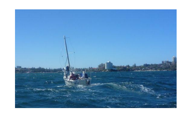
CC1 , Div. 2